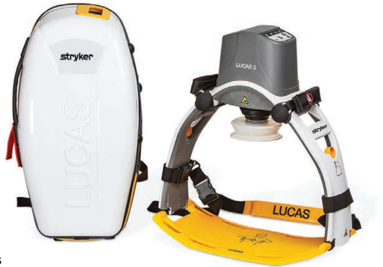
LUCAS Chest Compression System

The fall season brings an increase in the amount of open burning complaints the fire department receives. Communicating with the neighbor that is burning can sometimes eliminate the need for the fire department to intercede. Leaves, grass, trash and tires are some of the materials that are not allowed to be burned in the